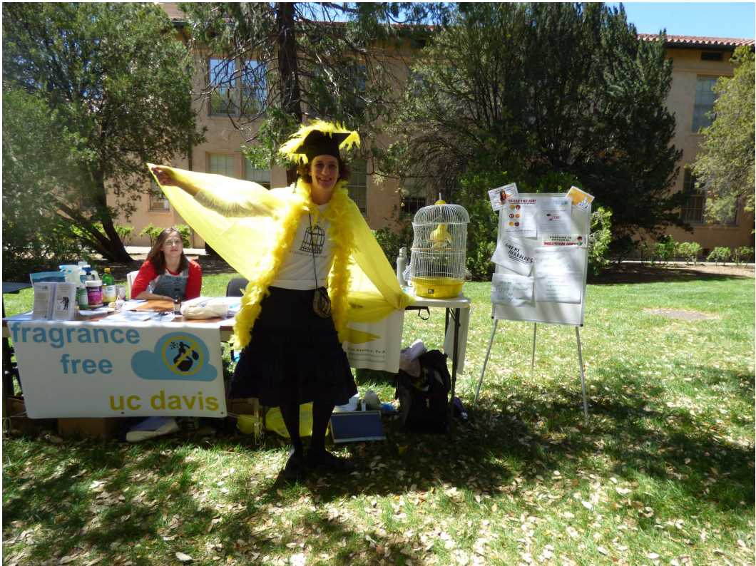
Figure 3. “Professor Canary” (Source: Liza Grandia).

for regulatory government functions through his cape-costumed escapades as “Civic Man” ( El Hombre Cívico ), I began to make campus appearances as “Professor Canary” in a yellow kaftan, boa, and befeathered mortarboard for my “Fragrance Free UCD” campaign.