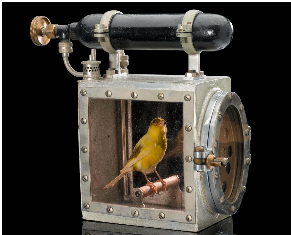
Figure 2. Canary resuscitator circa 1920–1930.

Jensen's captivating photo art book of MCS pathos (Rosenberg 2013). They starred in Amy Adams's encounters with aliens in the 2016 film "Arrival." A green Dutch chemical corporation that began as a coal mining company has even launched a nontoxic "Canary Life" home furnishing line.